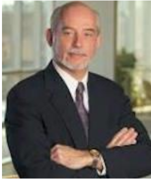
Russell A. Barkley, Ph.D. Medical University of South Carolina